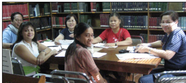
Photo : Several members of the current PTLA Working Committee

Information in the above article compiled and adapted by the Editor from the following sources :